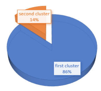
Figure 2: Percentage of village clustering

Clustering villages use fuzzy c-means aims to determine group of villages that have characteristics similar to characteristics village blankspot. Similarity of cluster labels and blankspot status is based on data exploration results. Number of villages clustering by fuzzy c-means method is presented in Figure 2. Based on Figure 2, it is known that number of villages clustering result in first cluster is 192 villages and in second cluster is 30 villages.